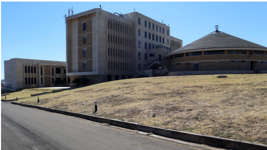
The new parliament building in Maseru Lesotho, September 2019.

China has established a direct presence in over fifteen African legislative institutions, through financing, constructing and maintaining parliament buildings. As highlighted earlier in the paper, the strategic importance of African parliaments has increased due to their multiparty membership and functional utility in national governance. However, China’s game-changing has been overlooked by most Africa-commentators, who see this as an undifferentiated part of China’s broader participation in infrastructure projects in Africa. China’s donation of parliament buildings has made it a key actor. It has fulfilled a need for purpose-built parliament buildings in African countries and managed to do so in a way that allows it long-term access to these facilities and, by extension, to the political representatives. The fact that China spatially organises the work of beneficiary African parliaments – an emerging aspect of China’s foreign aid - gives it high-level visibility in African political institutions. Added to this, the scale of the parliament buildings – landmark structures – has transformed the cityscapes, which gives prominence to the Chinese presence in these African states (see Fig 4).